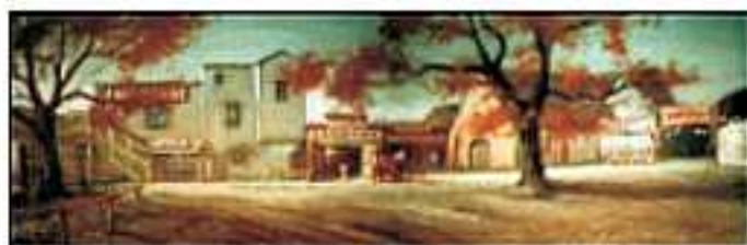
Top picture from Britmovie website. Third picture on first page from East Anglian Film Archive website. Left 4 feet wide Shampain painting.