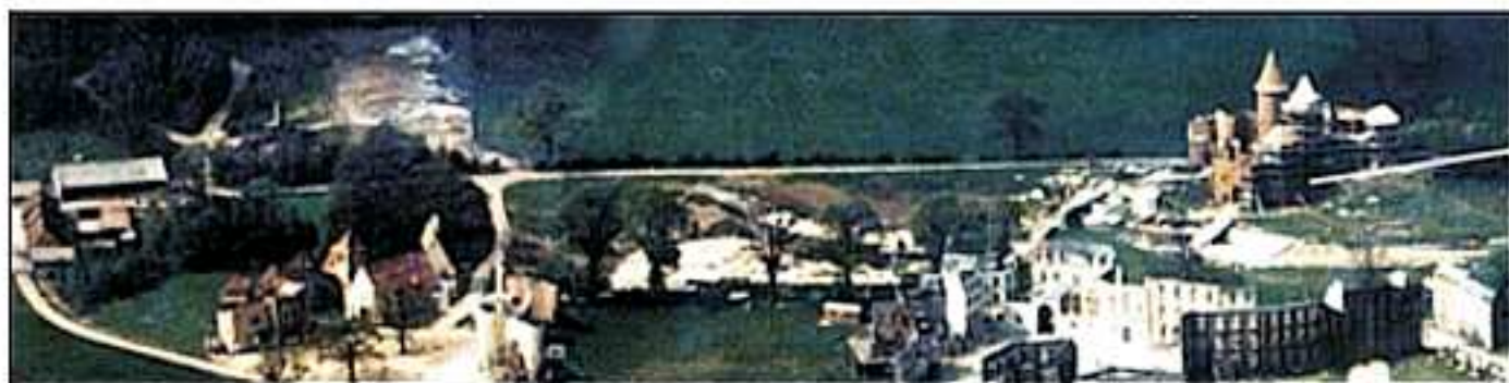
Above: The Harmony set on the left (also seen in The Schizoid Man ) and the Girl 'Witchwood' set on the right (also seen as the French street in A, B, and C.). Below, from another angle.